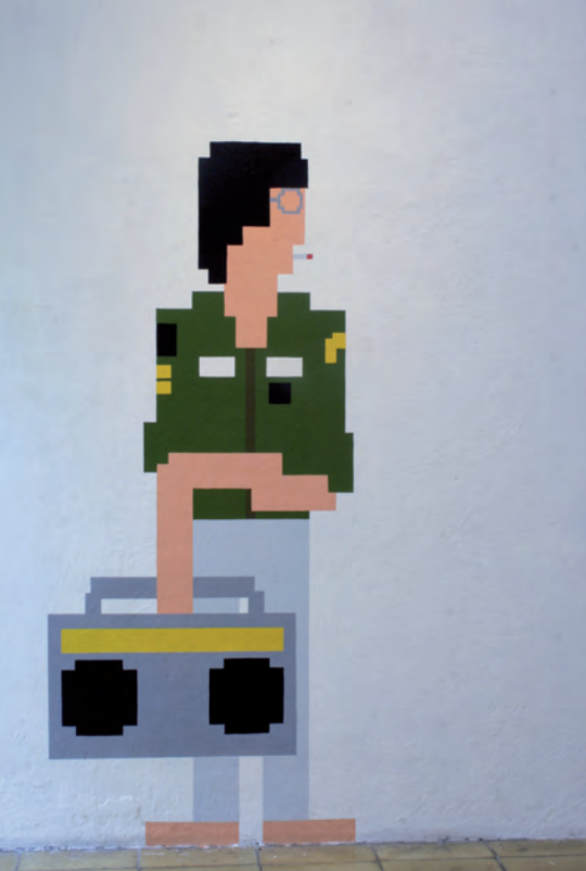
Terra Bajraghosa, John Lennon (Power to the People) , 2009, paint and acrylic on wall. Power to the Pixel (and to the Artisan) , is on at Cemeti Art House, Yogyakarta, Indonesia. Image courtesy Cemeti Art House. Photograph by Beiny Harsono. www.cemetiarthouse.com