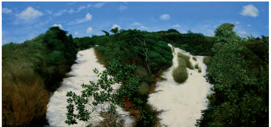
Chen Wei Meng, Rhu Tapai , acrylic on canvas. Two, Three, Six (236) the approximate length (km) of the coastline of Terengganu (Malaysia), from Kuala Besut to Kemaman, where Meng's paintings are drawn from. Showing at Wei-Ling Gallery, Kuala Lumpur, Malaysia, from 3 to 24 June. www.weiling-gallery.com

Asahi Breweries Ltd (Japan) has for a long time